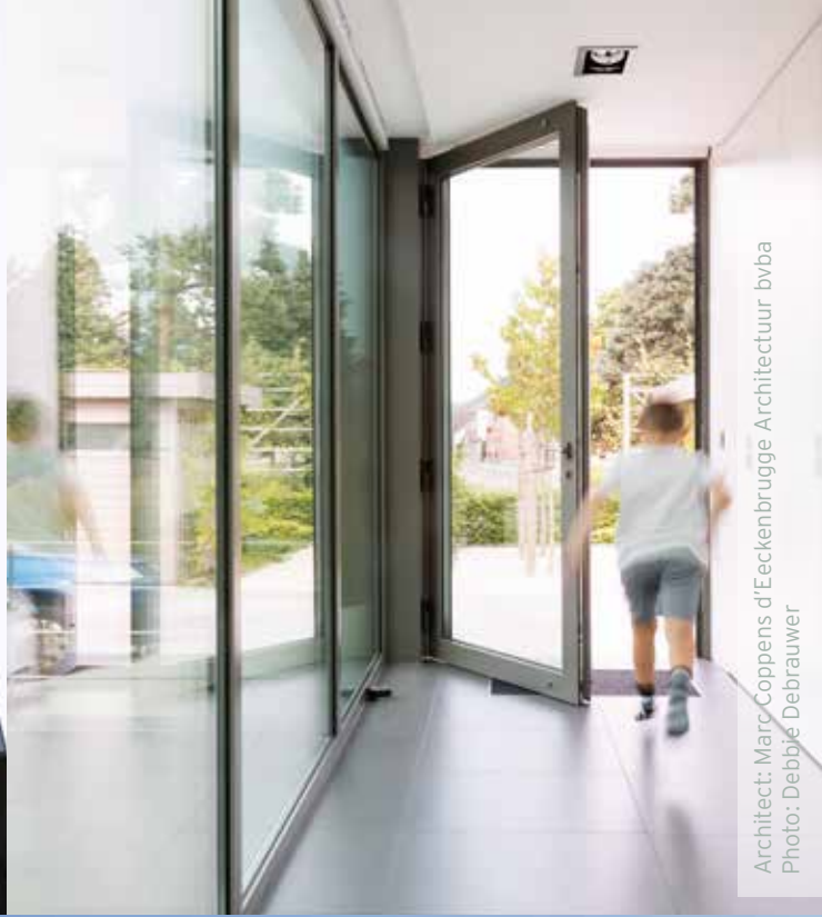
Architect: Marc Coppens d'Eeckenbrugge Architectuur bvba