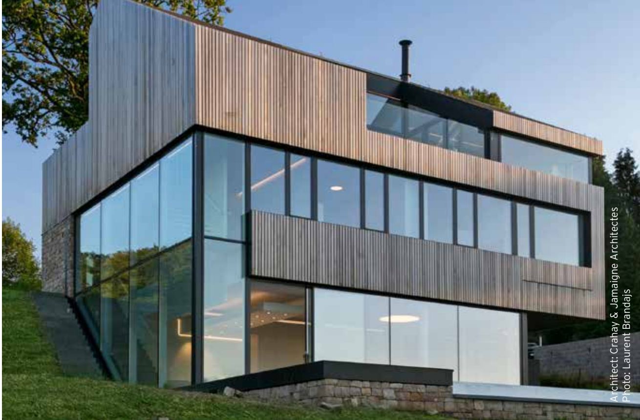
Architect: Crahay & Jamaigne Architectes